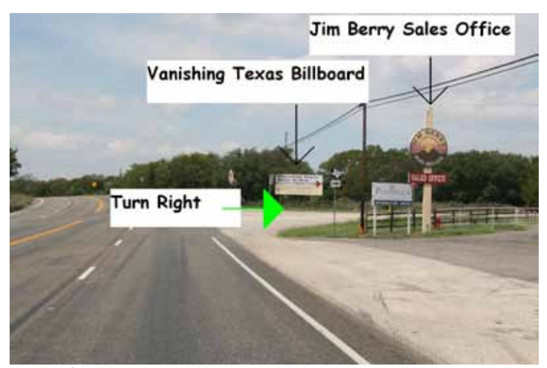
Turn right onto FM 2341 (pictured above). Continue for 13.5 miles

Once you arrive in Burnet, continue west on Highway 29 through the traffic light.