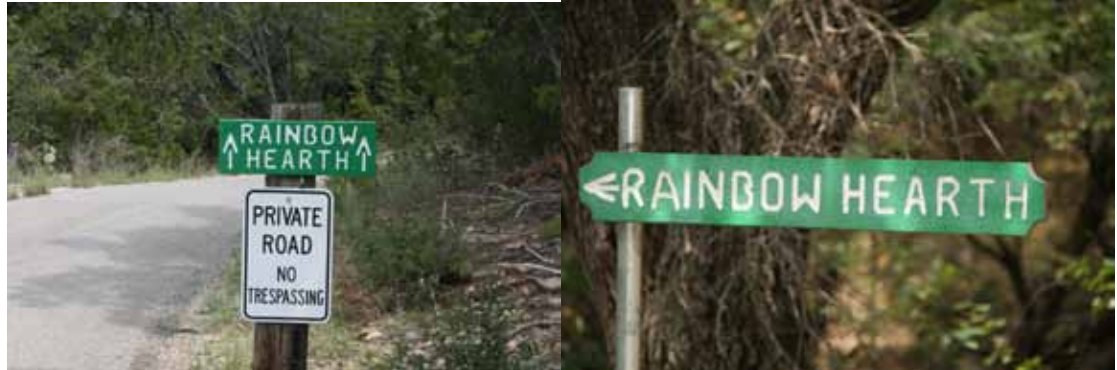
You will begin to see Rainbow Hearth signs (pictured above).